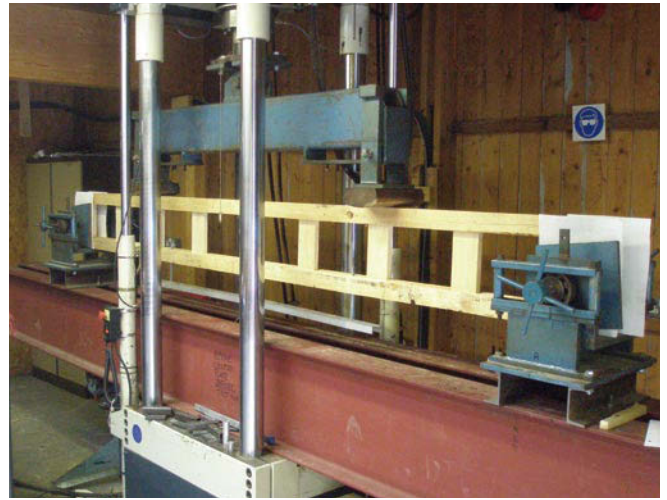
Shows the 4-point bending test setup used with Ty Unnos ladder beams.

The design of the ladder beams proved to be more difficult, as it was too complex to be justified by calculation due to the solid timber “rungs” acting as a discontinuous web. Consequently the design of ladder beams involved a series of development tests followed by a large number of tests on the final design to establish the load-bearing capacities.